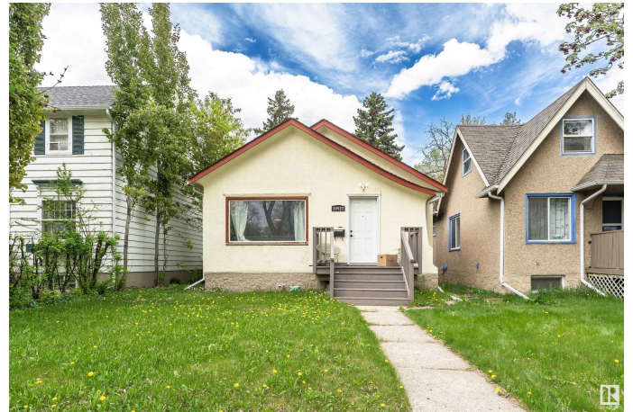
10922 84 Ave NW, Edmonton, AB

Main Floor Exterior Area 826.15 sq ft Interior Area 764.28 sq ft