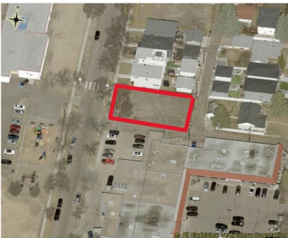
9115 143 St-Location